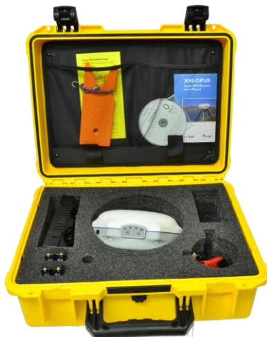
X900S-OPUS Complete Kit